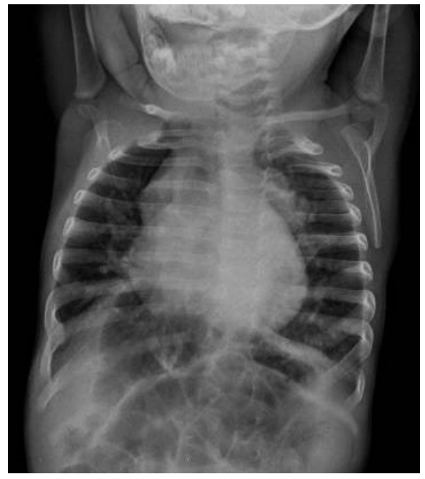
Figure 3. Chest radiography at one year of age with cardiomegaly and venocapillary congestion.