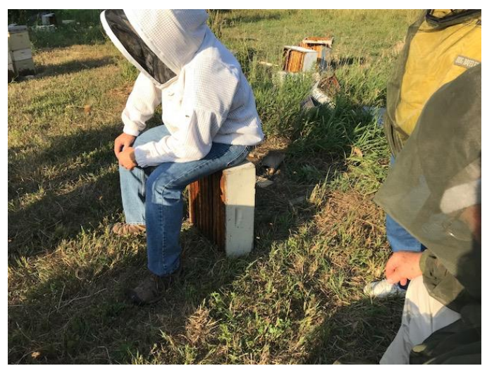
This is one of the folks at our mentoring group sitting on a super-a hive body gives you a wider seat.

My first job was with a beekeeper in California. He always kept 2 -8 frame hive bodies nailed together with lath and he would lay the lid off of the hive crosswise and lift the deep up that he was going through and set it crosswise on the lid so that he was working the deep while standing up. We talk about doing that but we never see to get two hives nailed together.