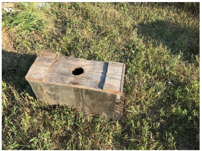
We usually keep a nuc box with us which makes a great seat but it too is kind of short. It is certainly better than nothing!

The seat on the left Cecil got at Harbor Freight and it is a great height to sit on to work bees. The seat on the right we got as a gift from Marion Ellis. It is a fantastic seat with great built ins to store your hive tool, smoker fuel, marking pen etc. It is a little short so if you build one you might want to make it a little bit taller—I will say we fight over who gets to sit on this one!