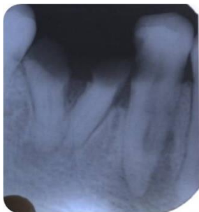
Fig.2: Working Length Radiograph