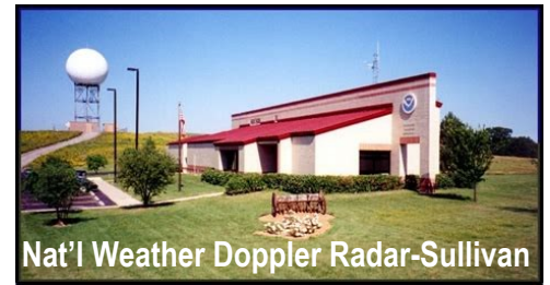
Nat'l Weather Doppler Radar-Sullivan