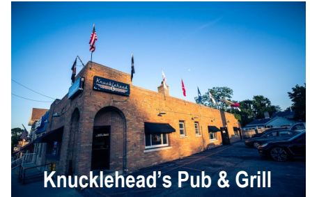
Knucklehead's Pub & Grill