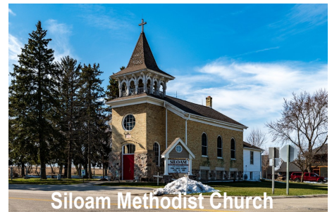
Siloam Methodist Church