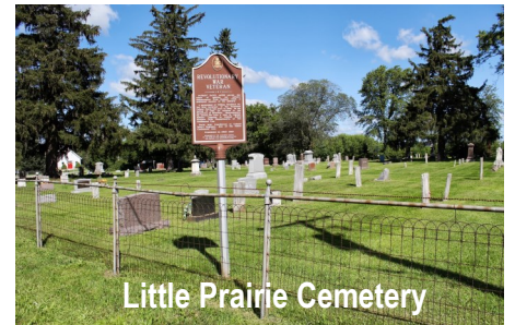
Little Prairie Cemetery