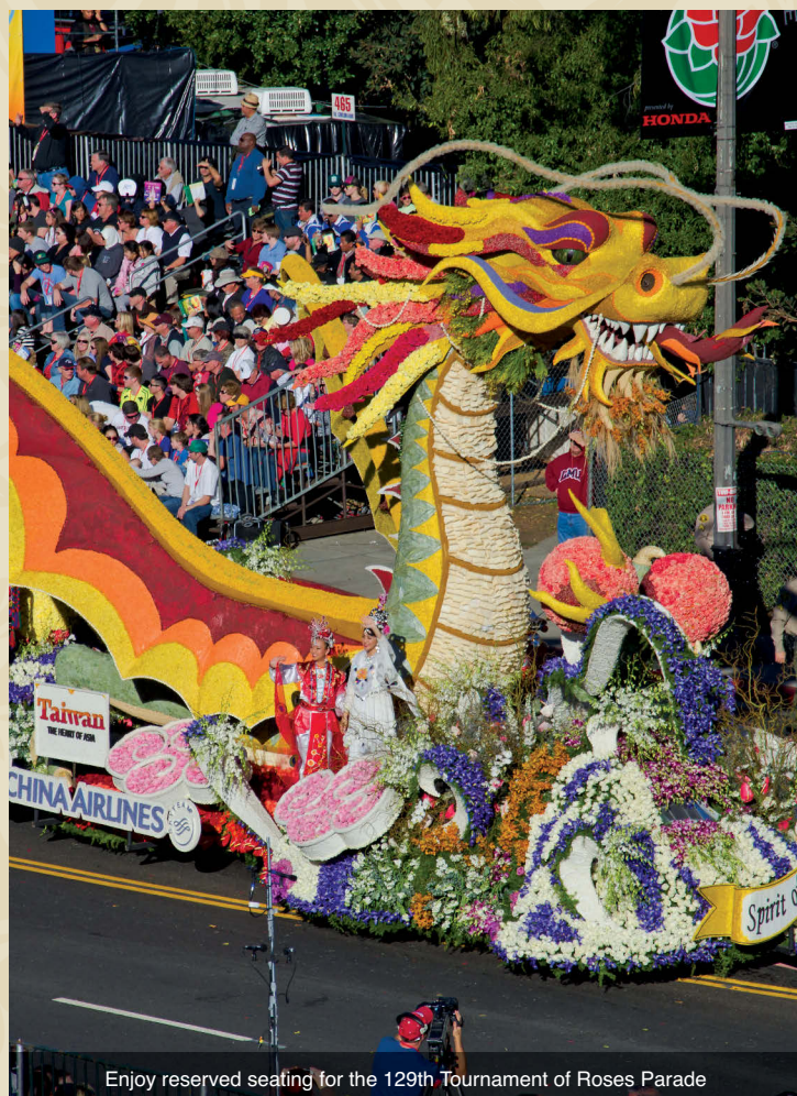
Enjoy reserved seating for the 129th Tournament of Roses Parade

Like all of our holidays, your transfer from the hotel to the airport is included for your flight home. Your Tour Manager will help you with arrangements to Los Angeles International Airport. Meal: B