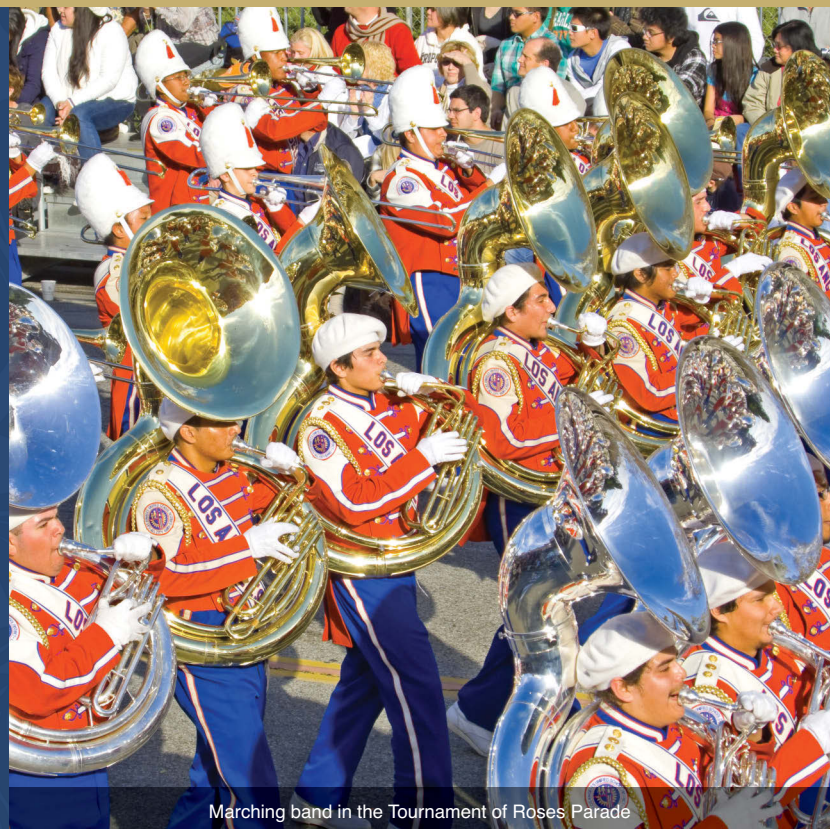
Marching band in the Tournament of Roses Parade