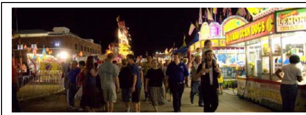
Evening Shot of Midway at Fair from What's Up Hutch.

5-9 3 rd Thursday's each month. Live Music, Art & lots of fun. Merchants are open to greet & visit as well as make sales at your convenience. Come Join Us...It's Lots of Fun!