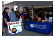
Another Good turn out!