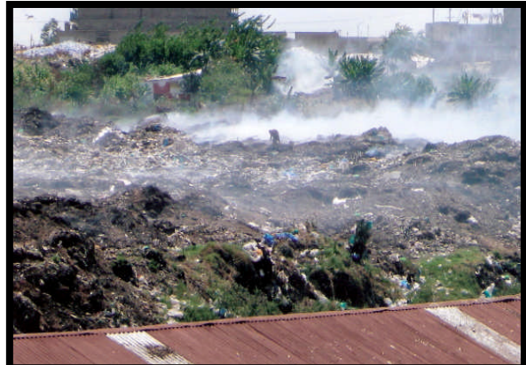
Slums in Dandora