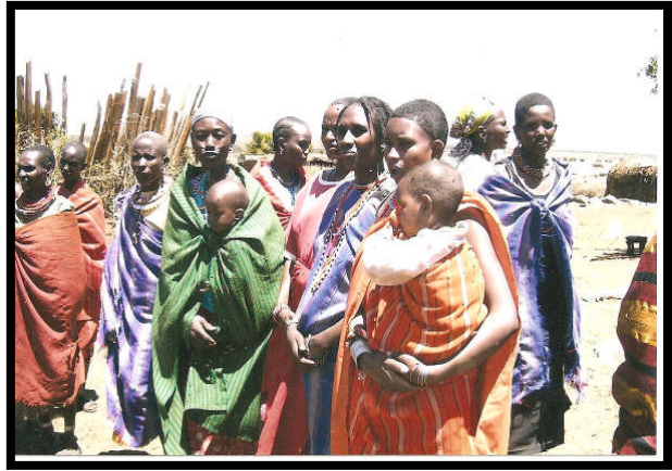
Samburu women who accepted the Lord

Let's work for Jesus while it is still day "for the night cometh". Be encouraged and fear not for God is in total control. He is allowing the world to go down just like the "Word" says it will. Get excited— we could be "THAT" generation that ushers in His return.