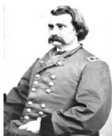
General John A. Logan

By the late 1800s, many communities across the country had begun to celebrate Memorial Day and, after World War I, observances also began to honor those who had died in all of American's wars. In 1971, Congress declared Memorial Day a national holiday to be celebrated the last Monday in May. (Veterans Day, a day set aside to honor all veterans, living and dead, is celebrated each year on November 11.) Today, Memorial Day is celebrated at Arlington National Cemetery with a ceremony in which a small American flag is placed on each grave. Also, it is customary for the president or vice-president to give a speech honoring the contributions of the dead and lay a wreath at the Tomb of the Unknown Soldier . About 5,000 people attend the ceremony annually.