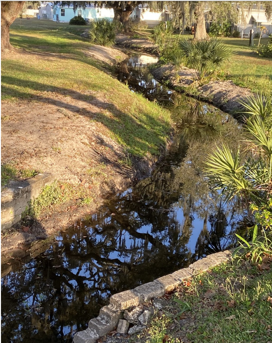
View from bridge facing west after work (Feb 2021)