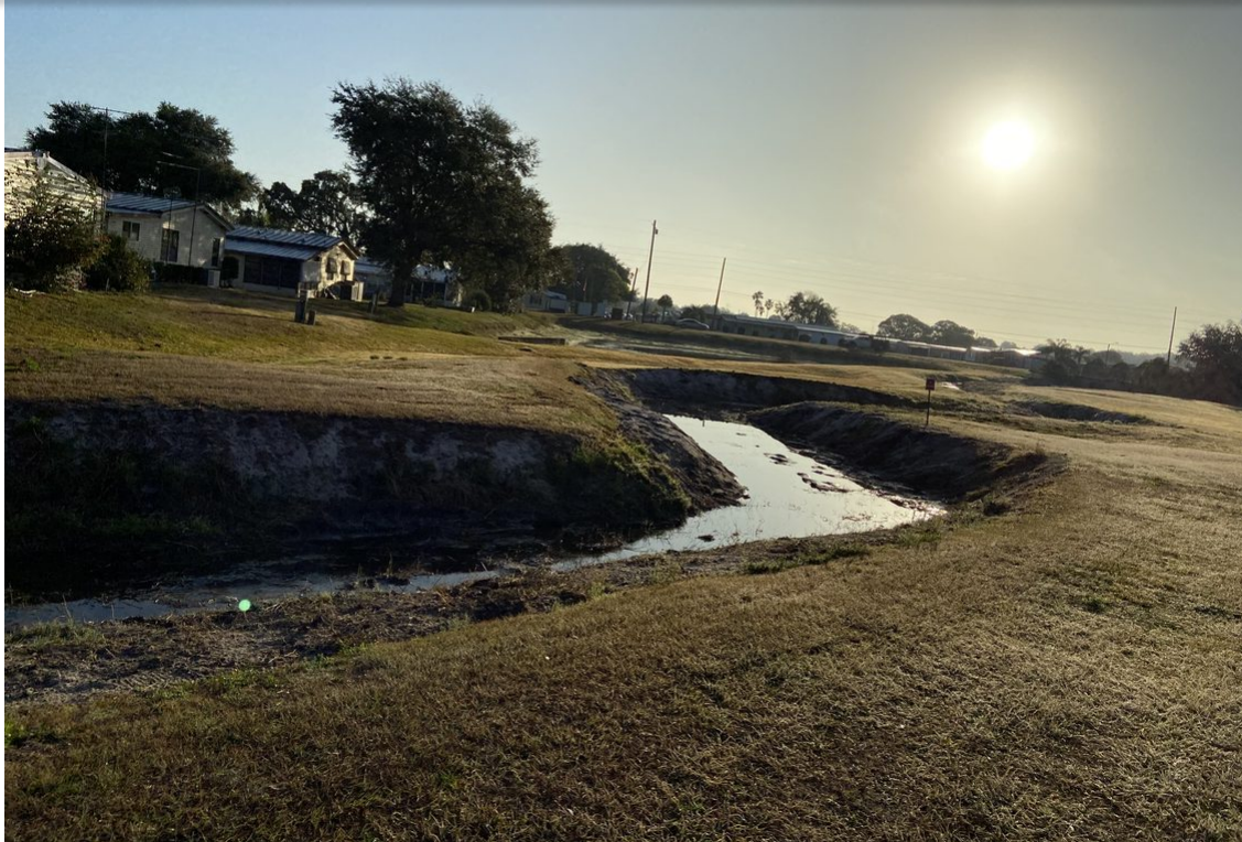
View from bridge facing East after work (Feb 2021)