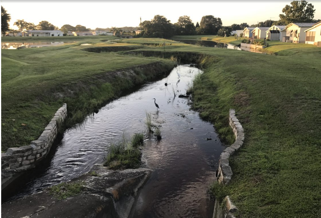
View from bridge facing East (circa 2017)