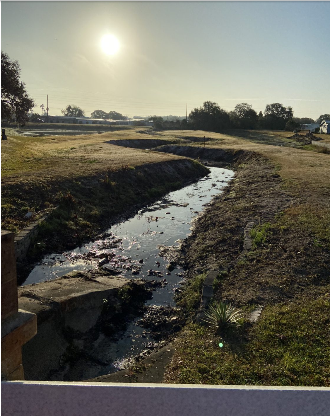
View from bridge facing East after work (Feb 2021)