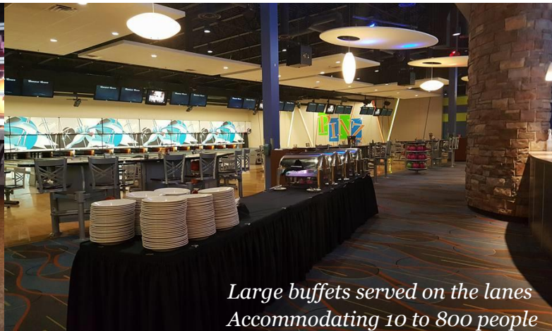
Large buffets served on the lanes Accommodating 10 to 800 people