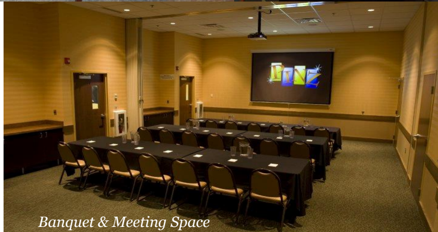
Banquet & Meeting Space