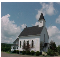
Saint Lawrence O'Toole 2340 Route 115 Irishtown, NB