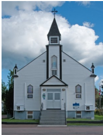
Our Lady of Mercy 11 St. Andrews Street Pointe-du-Chêne, NB