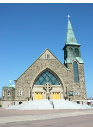
Saint Augustine's 340 Dominion Street Moncton, NB