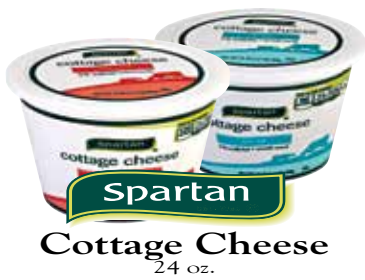
Spartan Cottage Cheese 24 oz.