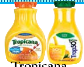
Tropicana Pure Premium Orange Juice or Trop50 59 oz.