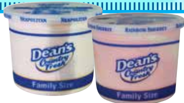
Dean's Country Fresh Ice Cream 4.5 qt. Pail