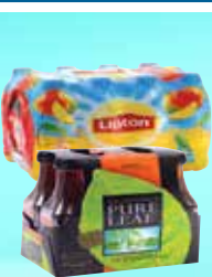
Coke, Sprite or Fresca 2 liter (plus deposit)