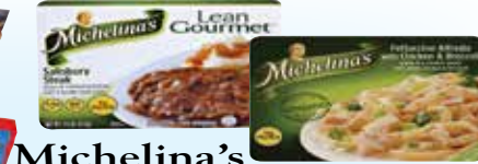
Michelina's Frozen Entrees 4.5 - 9 oz.