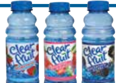
Clear Fruit 20 oz.