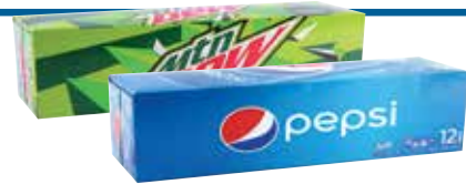
Pepsi Products 12 pk., 12 oz. cans (plus deposit)