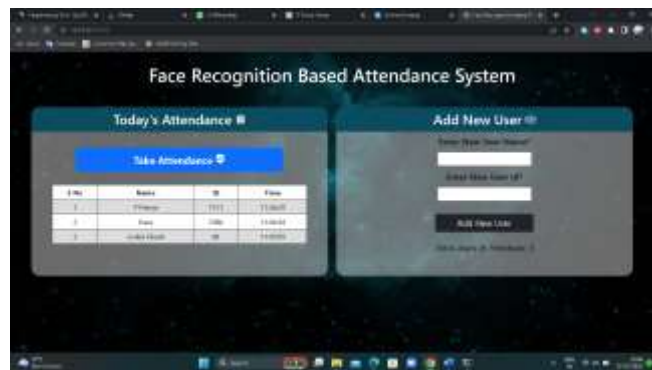
Fig. 2. The statistics and user registration the attendance system

Overall, the output screen of the Attendance System is designed to be user-friendly and efficient. It provides you with all the necessary information you need to track attendance, and the user registration block allows for easy integration of new users into the system.