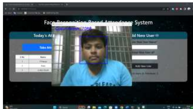
Fig. 3. The Output of the proposed System.

In summary, the output screen of the Attendance System with student facial image capture and attendance marking features is designed to be intuitive and user-friendly. It allows for efficient attendance tracking and helps to prevent fraud and errors that can occur with manual attendance marking. Figure 2 represents the attendance marking system.