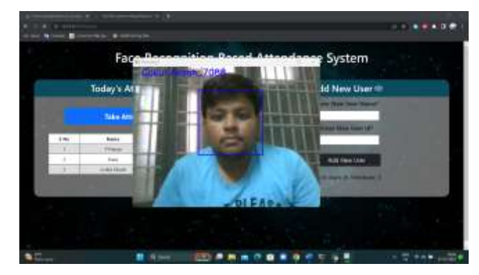
Fig. 3. The Output of the proposed System.

In summary, the output screen of the Attendance System with student facial image capture and attendance marking features is designed to be intuitive and user-friendly. It allows for efficient attendance tracking and helps to prevent fraud and errors that can occur with manual attendance marking. Figure 2 represents the attendance marking system.