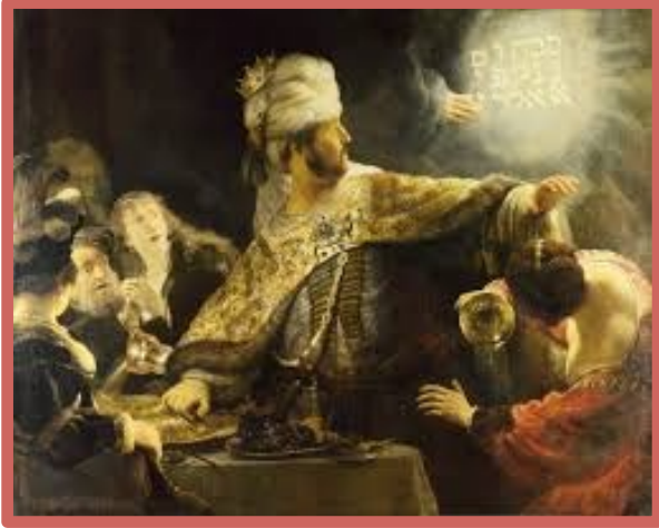
Rembrandt: Belshazzar's Feast

Died after 4 years left minor son Succeeded immediately by Nabonidus – not Marduk devotee, but moon god Sin, and tried to force Sin on Babylonians Caused dissension within Babylon. – transferred his residence from Bab to Edom; left affairs of Babylon in hands of crown prince Belshazzar. Jews served in Nabonidus army settlements in the Arabian peninsula may date from this time. Dissension in Babylon weakened it at a crucial moment Cyrus arises—from southern Iran to revolt against the Medes; Nabonidus makes treaty with Egypt and with [Croesus] Lydia [central Asia Minor] and that does not help.