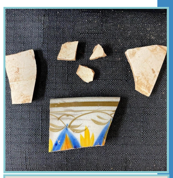
Five early 1800s creamware and one 1800s-1830s pearlware fragments found during the Fort Daniel Open House in May.

During the summer Fort Daniel Archaeological Park had many people to visit enjoying the public archaeology, visiting the museum and archaeol-