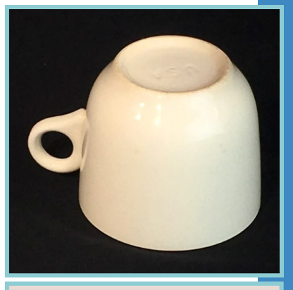
An intact cup with 'USA' mark and a similar shape

Because of the generic mark, the catalogues that archaeologists often rely on to identify ceramics (like Kovels' Dictionary of Marks ) were of limited use here. Instead I discovered similar objects in antique sale listings and trade publications. I discovered that the generic "USA" mark was first applied to pottery in response to more stringent import laws, like the McKinley Tariff Act of 1890, although there was no legal requirement that domestic products had to be marked. While more ornate ceramics were usually marked by a specific manufacturer, these were simple, everyday wears sold by retailers like Sears, Roebuck, and Company and Woolworths. Marketed as generic "plain white tableware," these ceramics were produced by companies including the Zanesville, Ohio based companies Shawnee Pottery and McCoy Pottery along with numerous others. The yellowish clay used to make both the Fort Daniel and Woodward-Mayfield cups may suggest a manufacturer in Ohio.