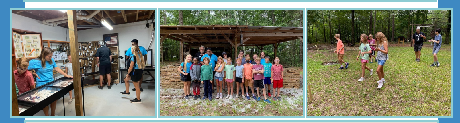
Gwinnett County History Camp day campers and counselors visiting the site

Visitors touring the fort, museum, and lab at Fort Daniel