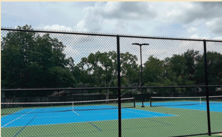
(continued on next page)

Plans are in the works for a big opening celebration once the work is complete. Watch your email and the Country Village Facebook page for more details.