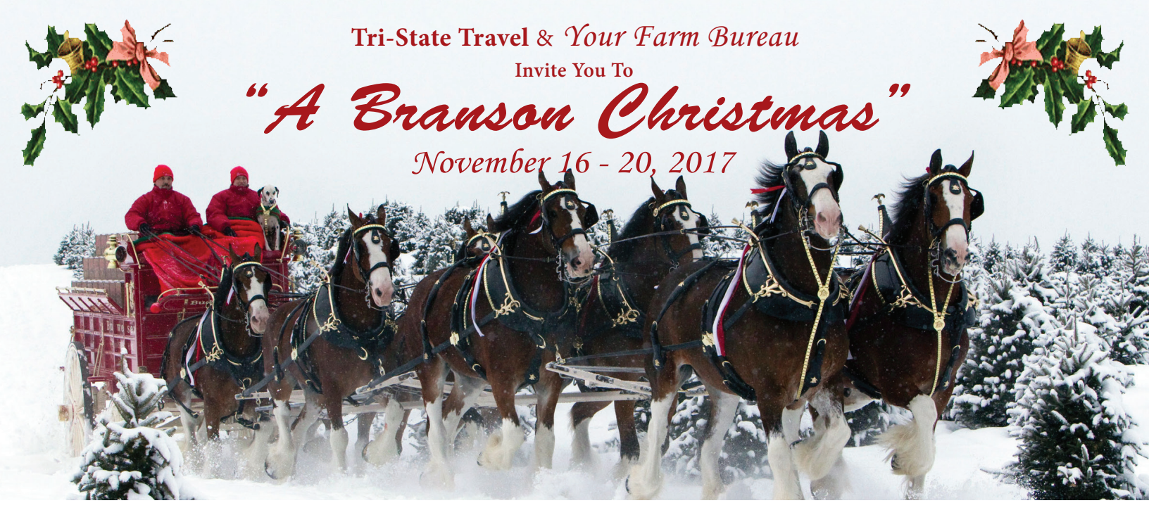
Join Us For This Fun Filled Christmas Adventure! Brilliant Lights, Festive Meals & Holiday Cheer, Great Entertainment And The Spirit Of The Holidays Are Waiting For You!!