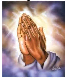
Begin the New Year With God

OUR ANNUAL MEETING of the Congregation and Corporation of The United Presbyterian Church of Plainfield, NJ is scheduled for Sunday, February 24 th , after worship service, in the Lind Room.