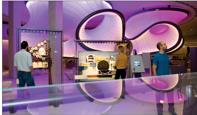
Mathematics: The Winton Gallery at the Science Museum, photo Jody Kingzett

The problematic concept of risk underlies most “Life and Death” objects. Consider the Pedoscope, an X-ray machine that resembles a peculiar-looking piece of wooden furniture. Designed in the UK around 1950, it displayed the fit of the foot in a shoe on a screen, and was especially alluring to children (including my elder sister, later a physician). But the cold-war 1950s was a time of high public concern about the dangers of radiation in the fallout from the atomic bombs dropped in 1945 on Japan. In the USA, where an equivalent device to the Pedoscope delivered a larger dose of radiation, a 1950 report by two physicians advised the medical community that “because of the latent period between cause and effect in low dosage radiation, it is impossible at present to determine merely by clinical examination whether or not deleterious influences have been produced by this device”. In the UK, the Atomic Energy Research Establishment was asked by the government to investigate the Pedoscope in 1956. 2 years later, the Home Office required all machines to be fitted with a health warning advising customers not to