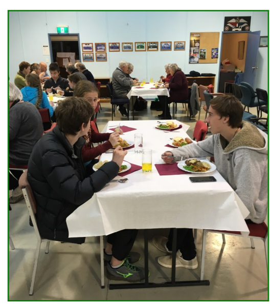
Good food at the end of a hard working day!

Overall Stamp Camp 2017 has been a very successful and productive camp. Everyone including the adults achieved the projects that they set out to complete with the standard once again being very high. Many thanks must go to the Auckland team for organising the camp. Once again the location was excellent and the overall week went smoothly and without a lot of fuss.