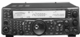
TS-2000 HF/VHF/UHF TCVR