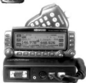
TM-D700A 2M/440 Dualband