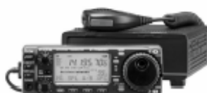
IC-706MKIIg HF/VHF Transceiver