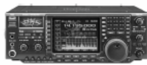
IC-756 PRO III All mode Transceiver