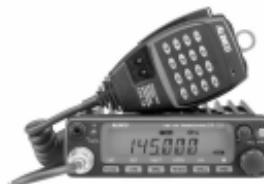
DR-135TP 2M mobile