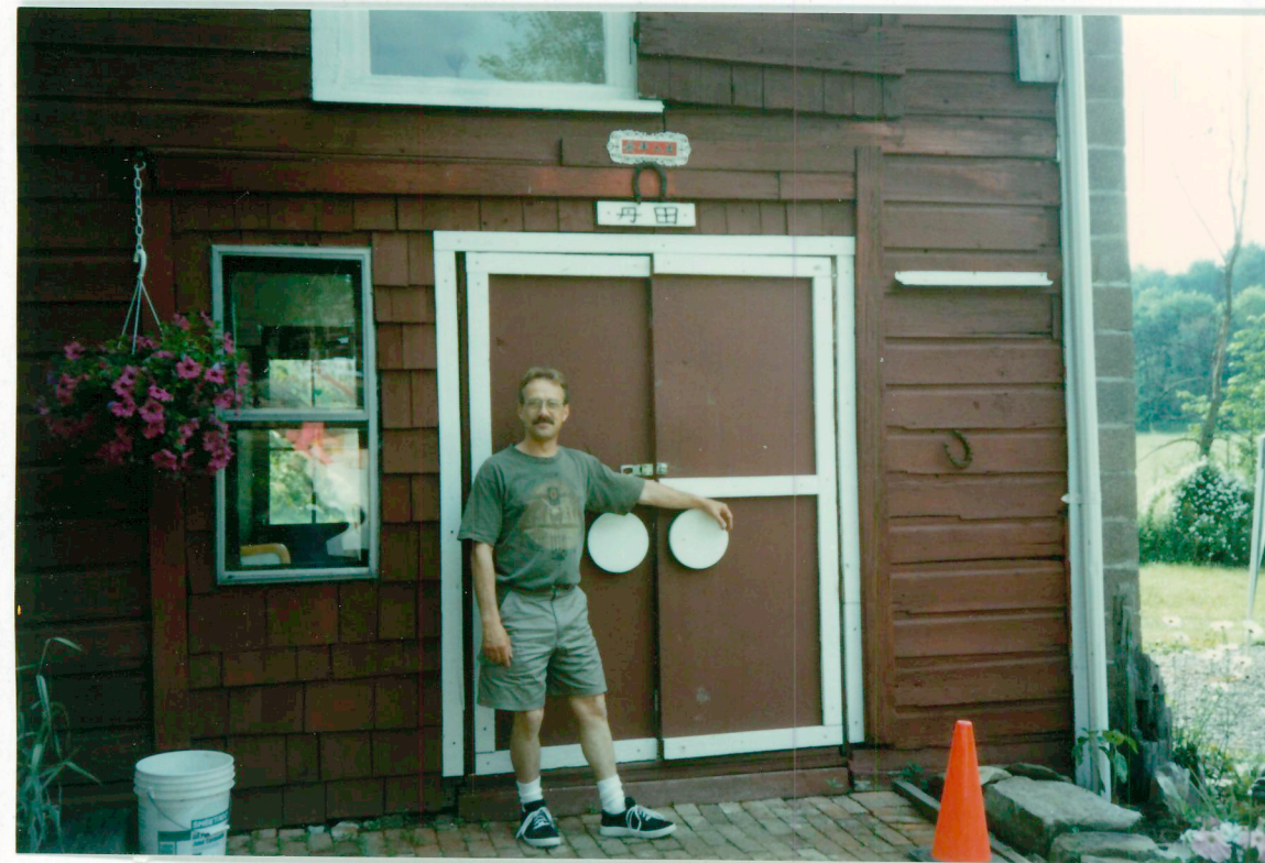
Making Ourselves Healthy