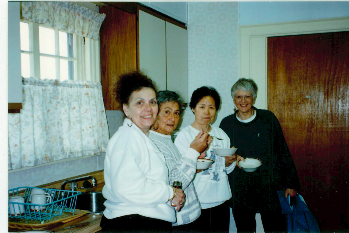
Making Ourselves Strong