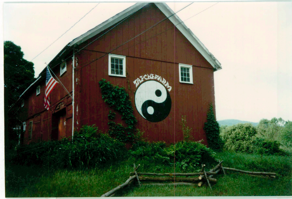
The Tai Chi Farm, N.Y.