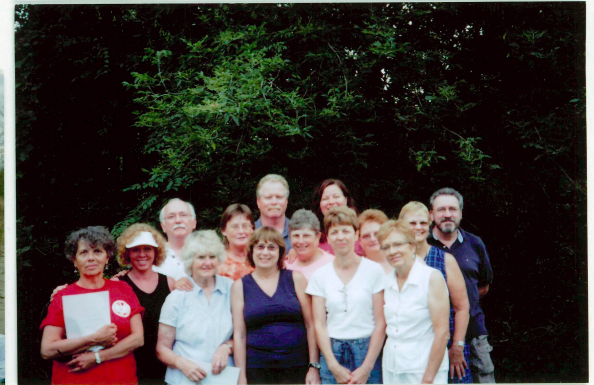
Five Oaks, Paris, Ont.