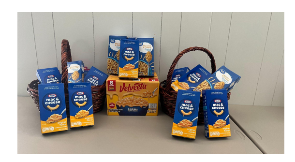
35 Boxes of macaroni and cheese were collected this month. These will be taken to Grace Bridge. Thanks to all who contributed.