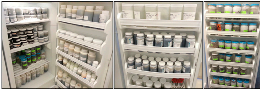
The National Sewage Sludge Repository at Arizona State University keeps hundreds of municipal sewage sludge samples in freezers at -20^{\circ}\text{C}.