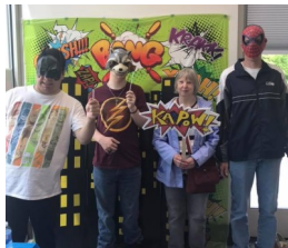
Rose Festival Parade and Superhero BINGO!