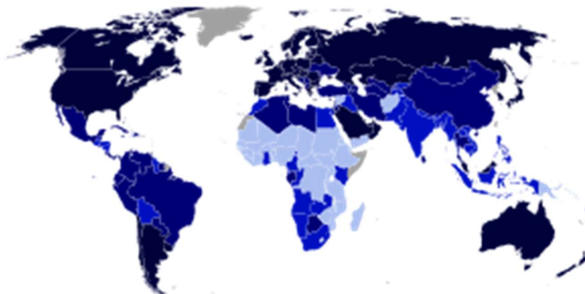
World map representing Human Development Index categories (based on 2017 data, published in 2018). [1]

Such challenges afflict over a billion citizens across the globe, and nowhere are these challenges more concentrated and prominent - and resolutions more imperative to improve the quality of life overall than in the nations in close proximity to the UAE.