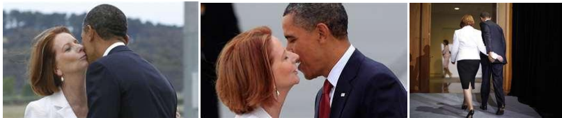
Julia Gillard, the Prime Minister of Australia, meets “The One”