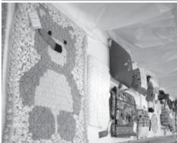
E. Mixed needlework [180210E]