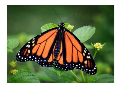
Newborn Monarch Butterfly - 27 Rose Epps