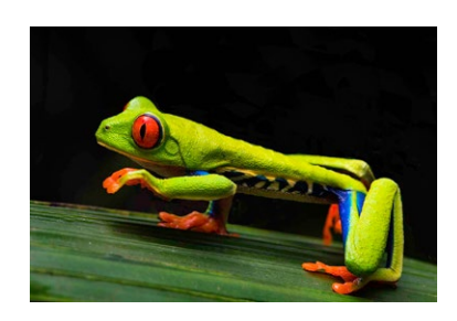
Costa Rica Tree Frog