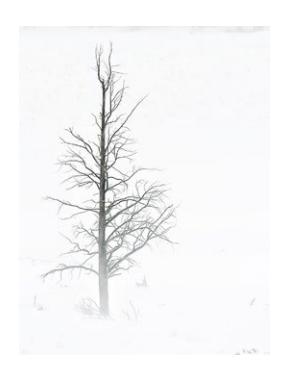
Solitude - 27 Paul Munch