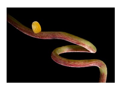
Gulf Fritillary Egg - 27 Linda Avitt