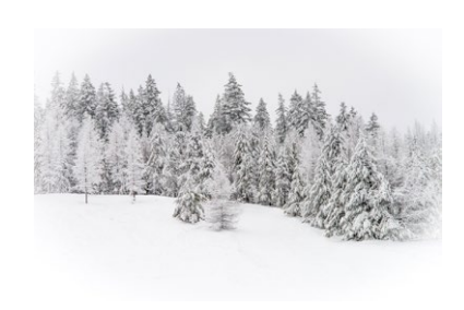
Loup Loup Ski Park, WA - 27 Pamela Walker