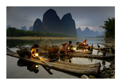
Li River Fishermen - 27 Jeff Lava