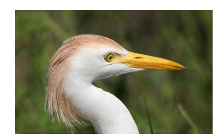
Cattle Egret Closeup - 26 Lewie Barber