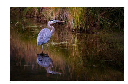
Waiting Patiently - 27 Cheryl Callen