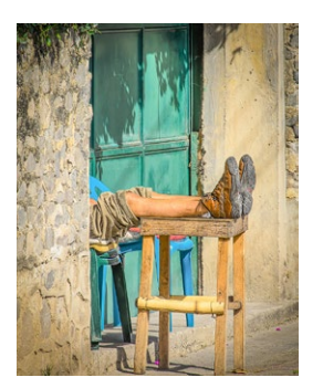
At the End of A Hard Day - 27 Thomas Vessely