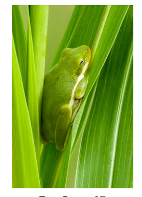
Tree Frog - 27 Desha Melton