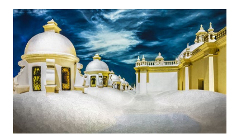
Leon Cathedral