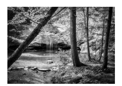
Woodland Waterfall - 26 Kathy McCall