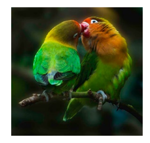
Pucker Up - 27 Stennis Shotts