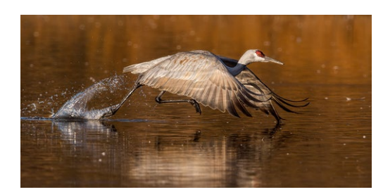
Take Off - 27 Cheryl Callen