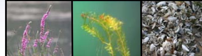
Purple Loosestrife Lythrum salicaria