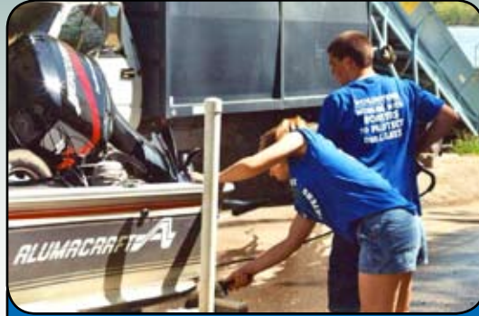
Montello Lake District

For more information about Clean Boats, Clean Waters and how you can help protect Wisconsin's lakes from invasive species, please contact: