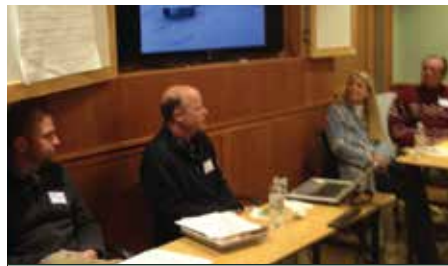
GUEST PANEL FOR NEWLIN TOWNSHIP'S 'CONVERSATION ON CONSERVATION' FORUM