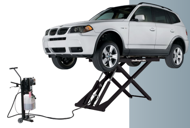
Model#: MR6 Portable Mid-Rise Lift 6,000 lb. capacity

Exclusive features include a sliding/rotating arm design with rubber pads, low drive-over clearance, and much more.