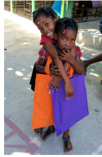
Melissa's Hope Orphanage/School

As we examined the amount of children's inventory donated to us following the Christmas extravaganza, we determined to expand our outreach to children and young people in difficult situations. Three immediate opportunities were opened. First, to an orphanage and school in Haiti we sent: 100 beanie babies, numerous toys, toiletries, teen devotional readings, and a GC card signed by all the volunteers who wrote encouraging notes. Second, GC crafters had created so many children's hats, scarves, and mittens that we were able to send bags and boxes full to Reo School in Lansing, followed by 50 toys, and 400 party bags for the school to use for the little awards given to children.