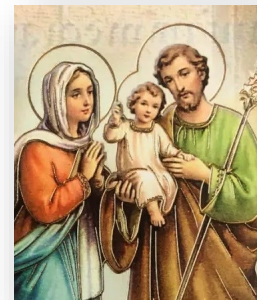
Feast Day: March 19

Sources: franciscanmedia.org , catholicculture.org