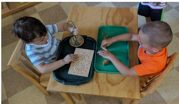
Sunflower Lacing & Life Cycle of Plant

Below are just a few of the classroom activities the children enjoyed throughout the week!