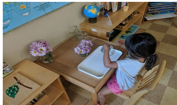
Flower Arranging Work