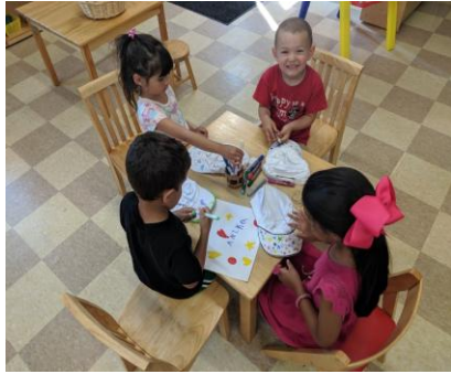
Decorating their Garden Hats

Finally, we decorated our clay flowerpots with flower stencils. Then, we planted Begonias in our pots to enjoy for the rest of the summer. I chose a Begonia plant because if cared for properly, they can flower year-round!