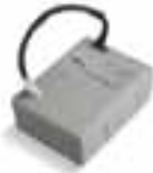
PS124 24 V battery with integrated battery charger. Pc/pack 1