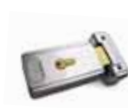
PLA11 Horizontal 12 V electric lock (required for gates longer than 3 m). Pc/pack 1