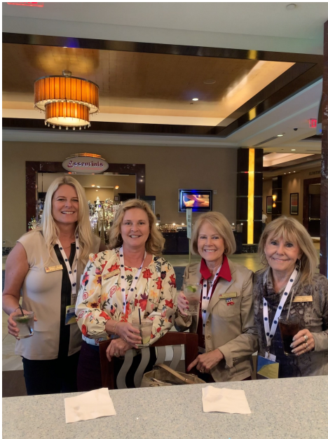
Our Republican girls having fun in the desert!