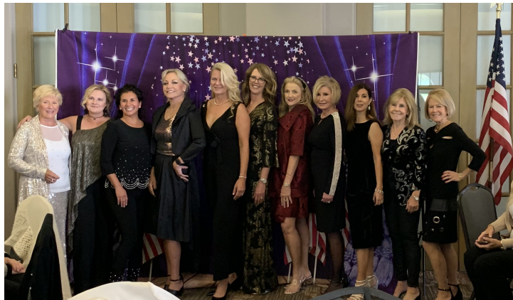
Our Fashion show was a tremendous success!