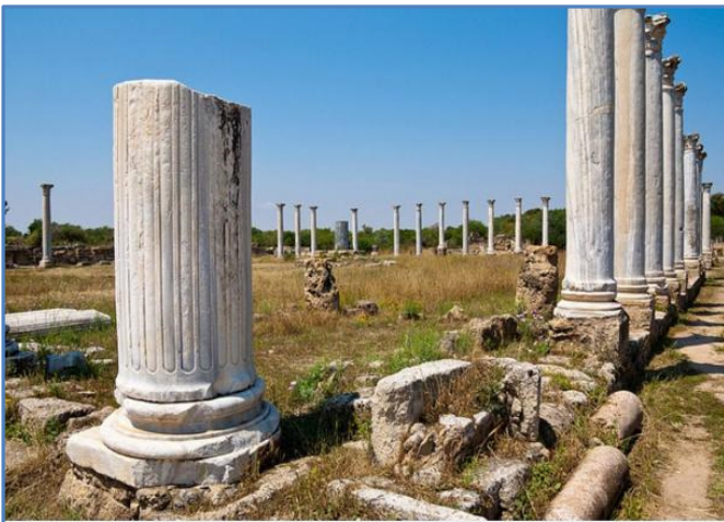
Columns surrounding the athletes' exercise ground

Built around a natural harbour on a large bay in the east of the island, it was an open window to the Levant and simultaneously a recipient and preserver of Greek civilization. The location made it possible for the town to develop as a wealthy and powerful commercial centre.