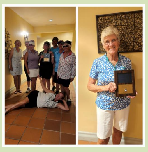
3<sup>rd</sup> Place Net/Central – San Vicente (right)