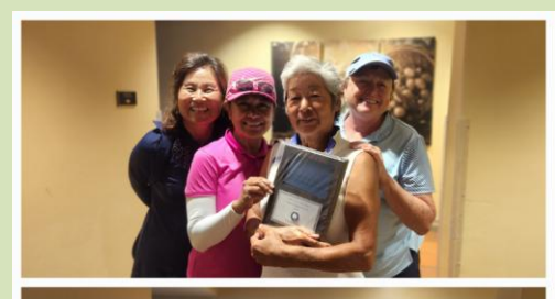
2<sup>nd</sup> Place Gross/Central – Twin Oaks