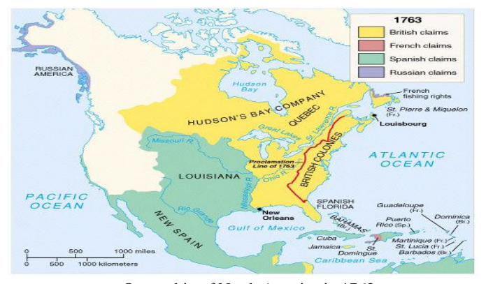
Ownership of North America in 1763

As of 1763, America control, through Britain, 39% of the 3.1 million square miles that will eventually comprise the nation.