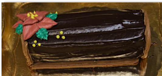
Special Yule Log