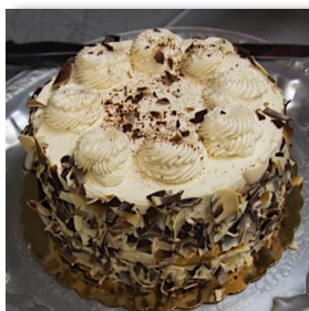
Italian Cream Cake