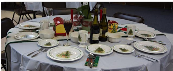
Beautiful Holiday Dinner Place Settings