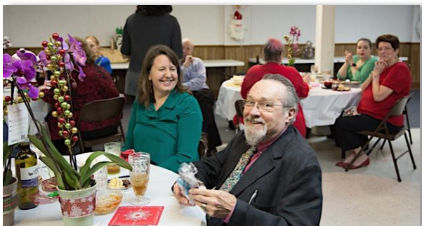
Happy December Birthday Lou Reed!