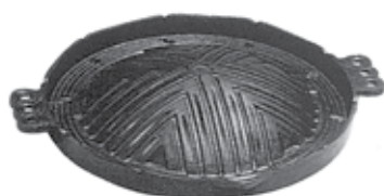
I RTP001, I RTP002

Heavy-duty cast iron plate with concave shape to fit exactly on burner. Ridges added for attractive grilled texture on tortillas, pita breads, etc.