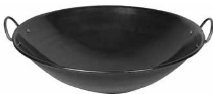
IRWC001 ~ IRWC005

Prevents drips with curved rim. Heavy iron wok with rounded handles. Made in Taiwan.