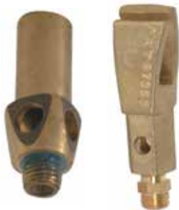
Duck Burner Nozzle IRBN002L, IRBN002N