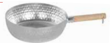
ALSP002, ALSP003, ALSP004