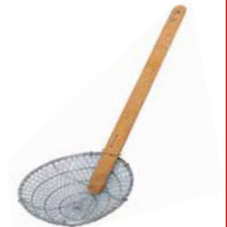
SLSKR004 ~ SLSKR014