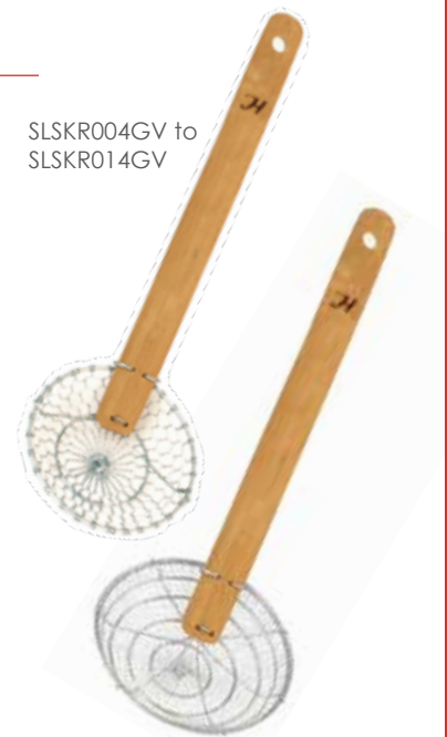
SLSKR004GV to SLSKR014GV