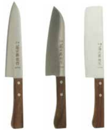
JAS013001 JAS013002 JAS013003