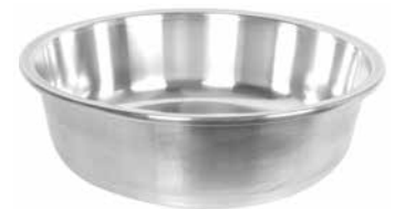
ALBS001 ~ ALBS007