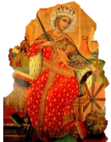
Great Martyr Catherine of Alexandria December 7

PAUSE THIS TUESDAY (THE ENTRY OF THE THEOTOKOS) AND LISTEN FOR THE FIRST ANNOUNCEMENT.