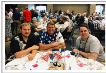
Top - Buchanan's barn fresh 1919 Essex.