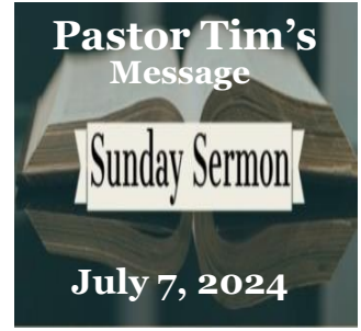
Psalm 48 2 Corinthians 12:2-10

Our Sunday Worship Services begin at 10:00 a.m. - We will also be "live" streaming!