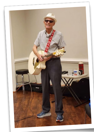
2023: A Garden Party with Live Music