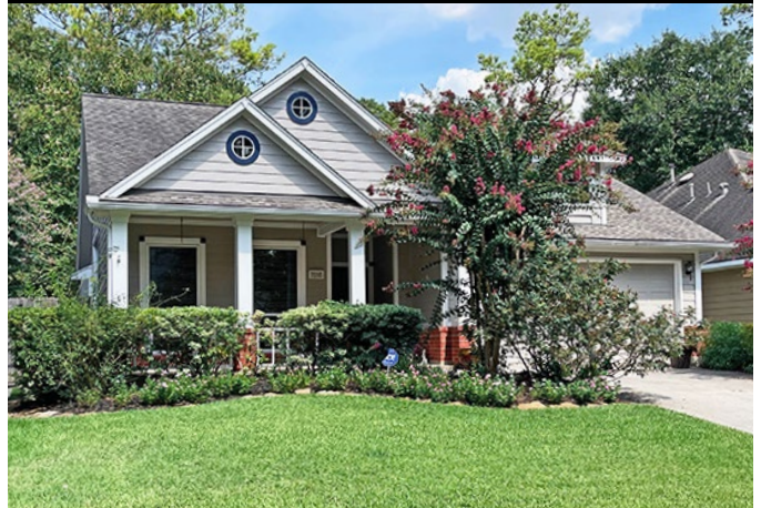
7918 SINFONIA DRIVE