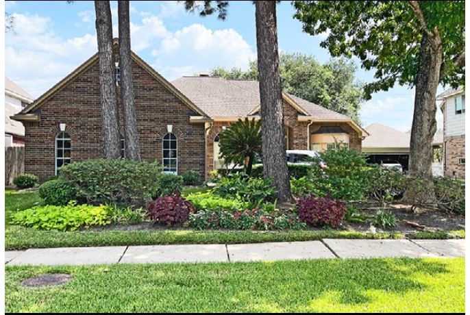
7703 ALLEGRO DRIVE