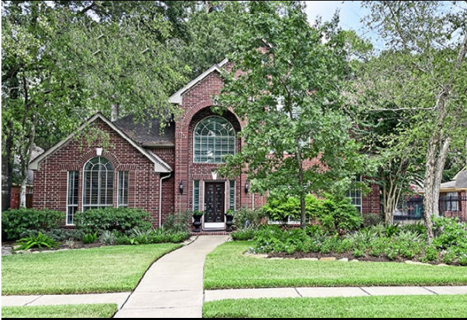
7910 ENSEMBLE DRIVE