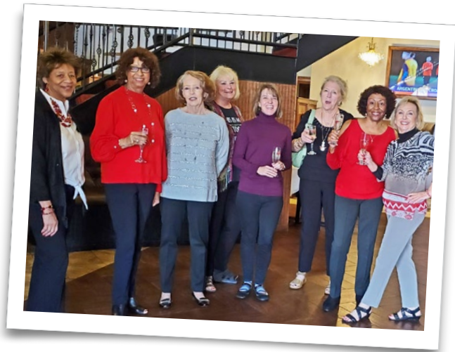
2022: Christmas Holiday Luncheon

Our new season begins September 2023 – come join us!