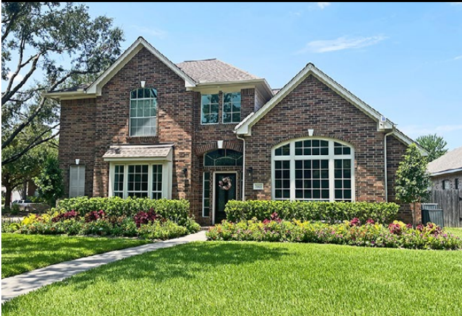
7703 ADAGIO AVENUE