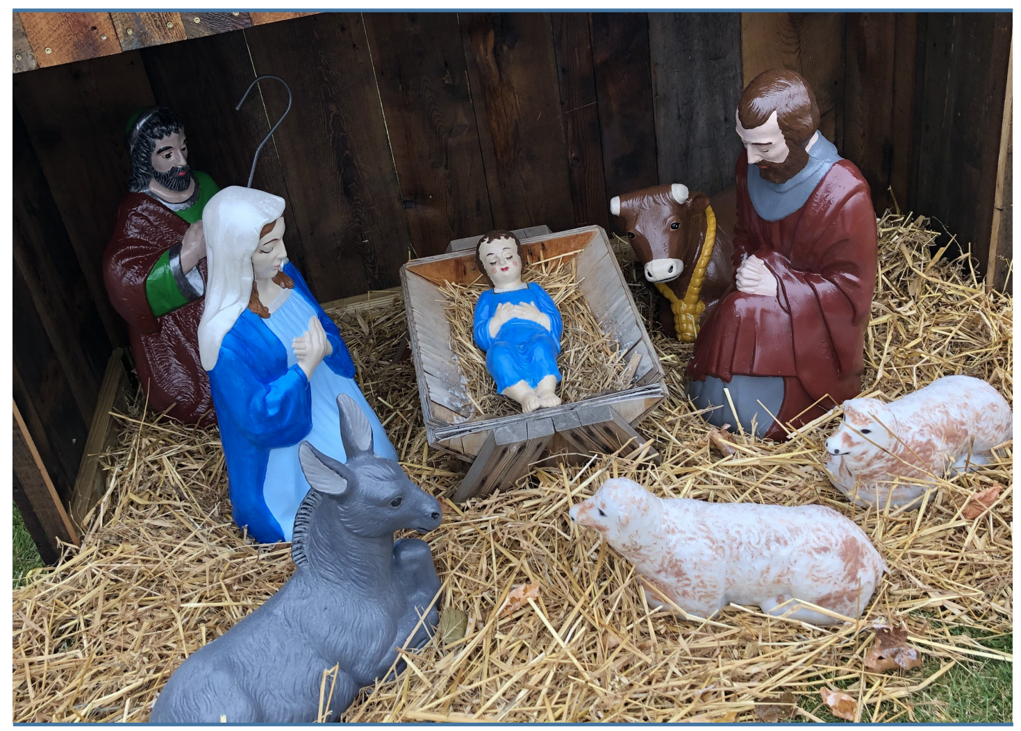
May You Find Christ Here...May You Bring Christ to the World!