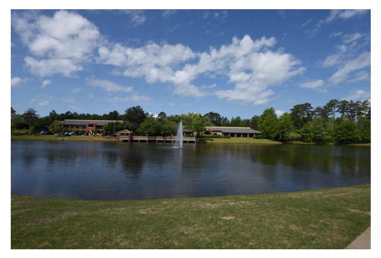
Our next door neighbor was Talbot Rehabilitation Hospital ( no connection to your editor), one of the most exclusive "drunk tanks" in the South. Was there a message there?