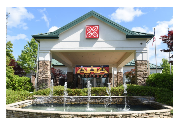
The Hilton Garden Inn—our home away from home in Columbus. A little upscale from our digs in 1965.