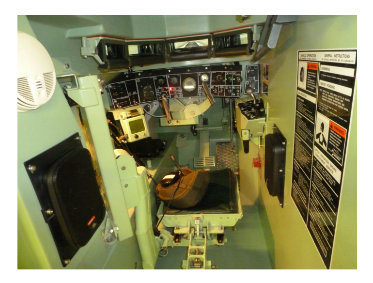
Gone are the bleachers and stands—replaced by virtual simulators where you blow up tanks and enemies. No more freezing your butt off in the winter.