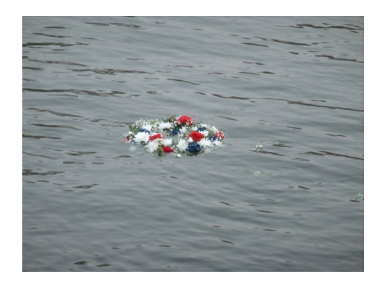
This is better than how I remember the Chatahoochee in the winter of '57.