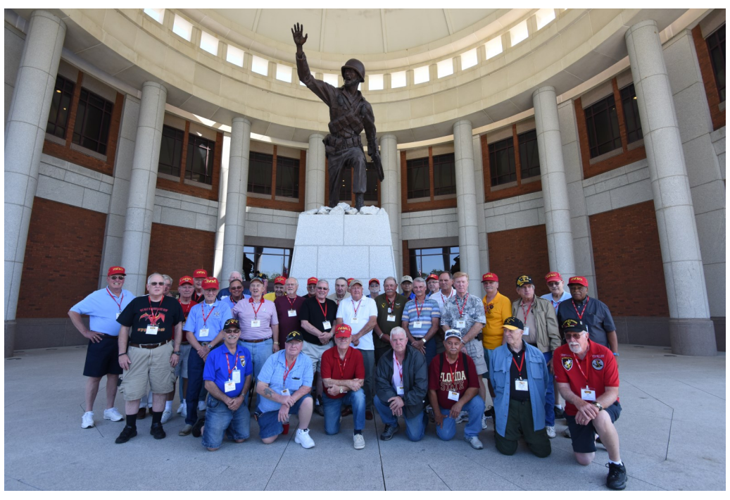
In front of the Infantry Museum and the Doughboy Statue