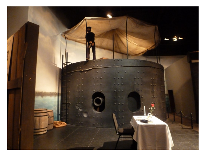
In the shadow of a replica of a revolving gun turret in the Civil War Navel Museum we held our farewell banquet and paid honor to those who are MIA as well as KIA.