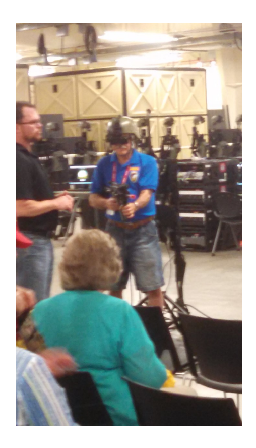
Killer Voeltz virtually wipes out the attacking enemy. What does Chuck know about using automatic weapons?