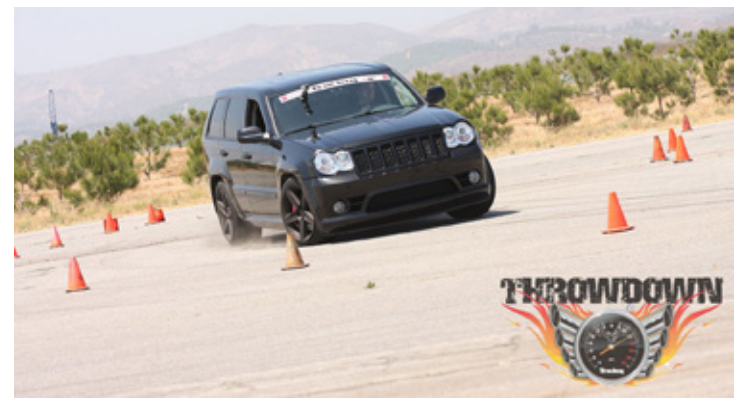
Second place: Greg Oberg, 2008 Jeep Grand Cherokee SRT8